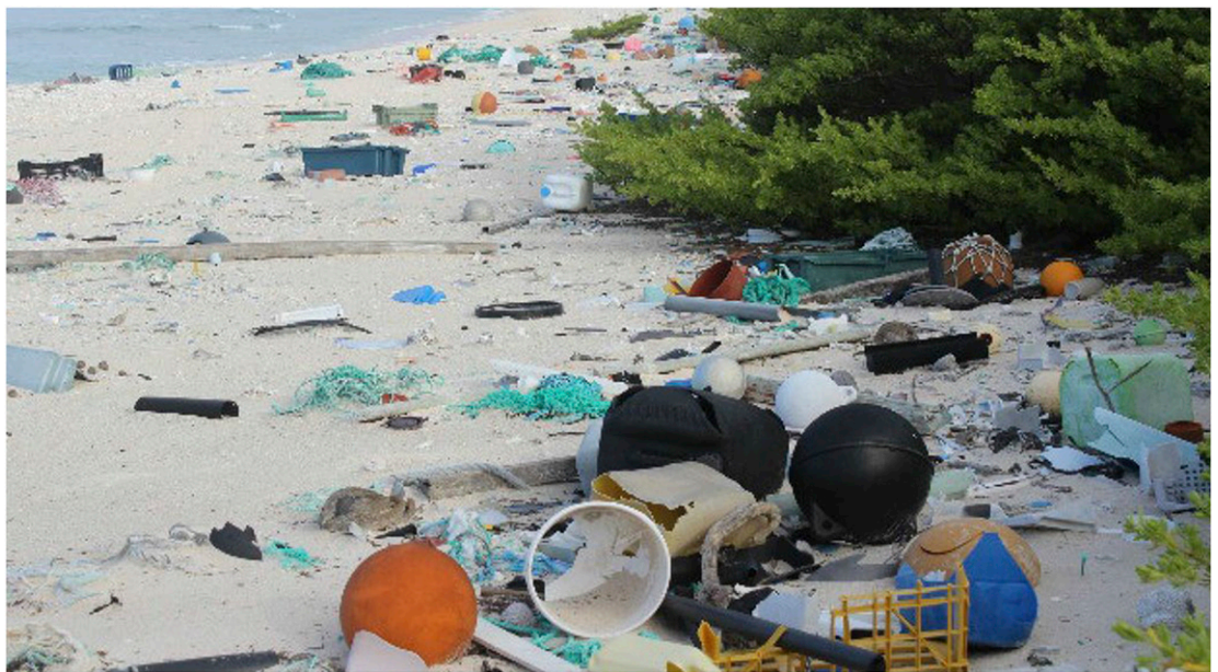
Plastics are accumulating across the globe at an astounding pace, even in remote places like the one pictured here—the uninhabited Henderson Island in the South Pacific. The time is ripe for an international agreement with measurable reduction targets to lessen the plastic pollution in the world's oceans. Reprinted with permission from ref. 19.

An estimated 4.4–12.7 million metric tons of plastic are added to the oceans annually (3). Like many other contaminants (such as greenhouse gases and ozone-depleting substances), plastic is not constrained by national boundaries, because it migrates via water and air currents and settles in benthic sediments. More than 50% of the ocean's area sits beyond national jurisdiction, including the